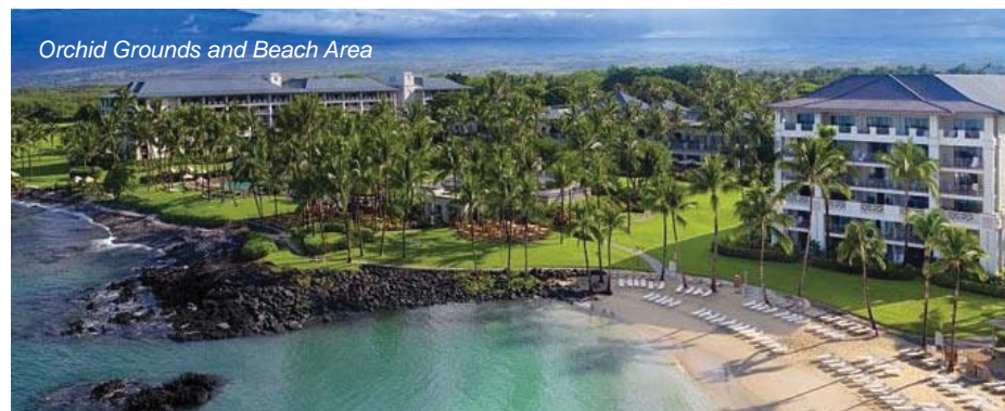
Orchid Grounds and Beach Area