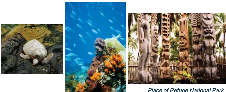
Place of Refuge National Park

The Big Island has one of the world's most active volcanoes (Kilauea), the tallest sea mountain in the world at more than 33,000 feet (Mauna Kea), and the most massive mountain in the world (Mauna Loa). Hawaii's varying and dramatic climate zones generate a world of environments on one island, including lush rain forests, volcanic deserts, snow-capped mountaintops and beautiful black sand beaches.