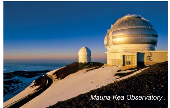
Mauna Kea Observatory

SpeediShuttle provides shared ride airport transportation in Mercedes shuttles between the Kona Airport and the Fairmont Orchid. Guests with pre-arranged arrival reservations will be met by their driver at the baggage claim area, then directed to their shuttle. Vehicle amenities include complimentary Wi-Fi, 6'1" headroom, three-point seat restraints, adjustable head-rests and roomy comfortable seats.