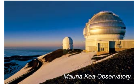
Mauna Kea Observatory

http://tinyurl.com/www-hawaiianairlines-com-pref