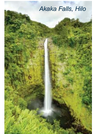
Akaka Falls, Hilo