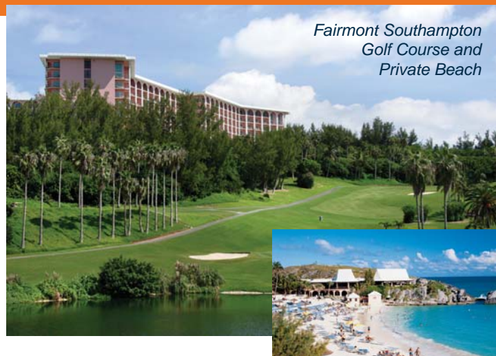
Fairmont Southampton Golf Course and Private Beach

Make your reservation early as rooms will likely sell-out before the cut-off date of June 1, 2017. Conference rates for reservation requests made after this date cannot be guaranteed and will be extended on a space and rate-available basis only. A credit card number is required to guarantee your reservation.